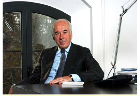
"We hope to submit to the AGM the proposal of a €9cts dividend for FY2010".

Even in the third quarter of 2010, revenue dynamics remain affected by the fall in energy commodities price; nonetheless,